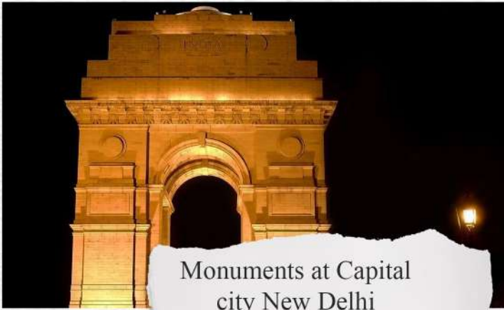
Monuments at Capital city New Delhi

Discover the vibrant culture of quintessential India through educational visits and safaris