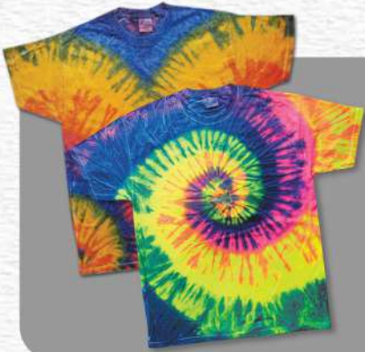
Tie and Dye

Experiential Learning through hands on activity workshops Unleash your creativity.