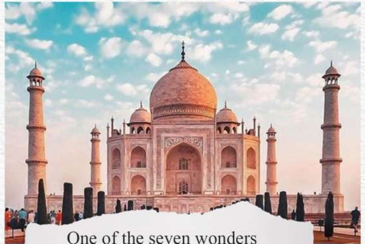
One of the seven wonders of the world-Taj Mahal at Agra