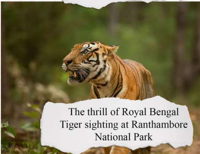
The thrill of Royal Bengal Tiger sighting at Ranthambore National Park